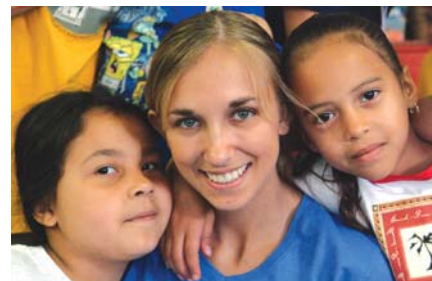
CSM participants in Chicago help children work on craft projects at Casa Central, the largest Hispanic social service agency in Illinois