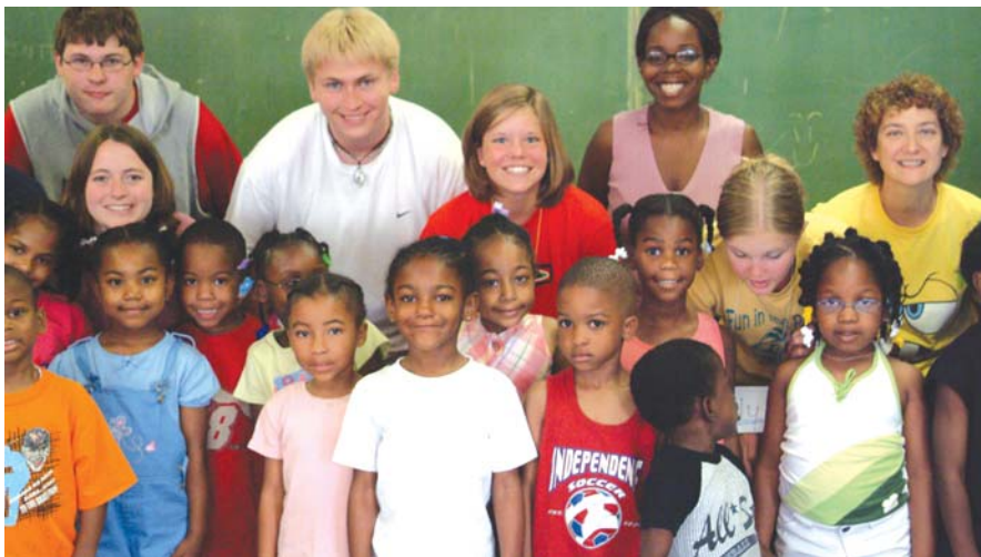
Students from Circle-Rock Prep School in Chicago and CSM participants gather together one last time after enjoying the day together.

who work in the factories. Teachers work against all odds—learning disabilities, gangs, drug use by parents, and all kinds of abuse—try to maintain contact with parents or guardians who don't speak English or have a phone.