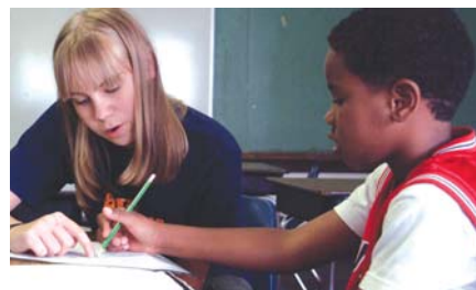
A CSM participant tutors a student at Circle-Rock Prep School

For many teenagers (and adults) who grow up in middle- and upper-class America, grasping the concept that poverty exists in our backyard is sometimes difficult.